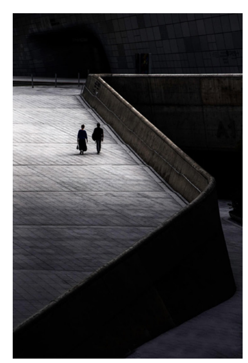
1st Place "Untitled" by Jeff Dytuco ISO 100; f/9