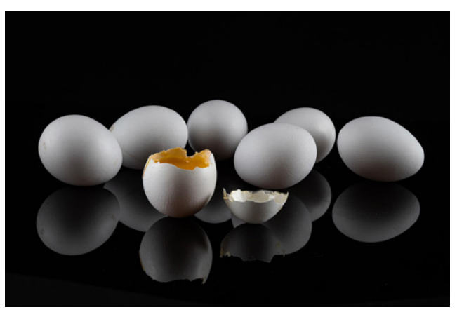
3rd Place "First to Go" by Willie de Vera ISO 200; f/22; 0.40sec