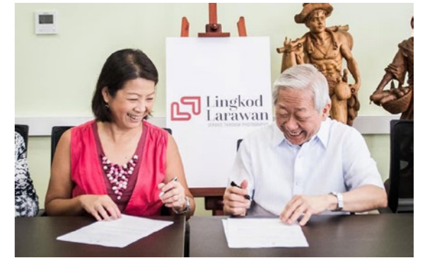
The signing of the Memorandum of Understanding.