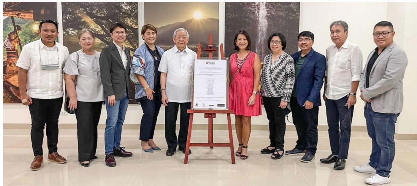
The Zone V Board with the UPMAFI and Crucible Gallery partners.