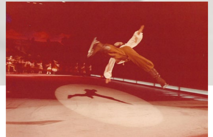
"My Shadow and Me" - her winning entry as Photograph of the Year

As for personal achievements, she has stayed true to her Catholic faith, raised four beautiful daughters, successfully ran her own businesses, lived life to the fullest, and made sure to take snapshots of these personal milestones not just in my heart and mind, but also in photographs and film.