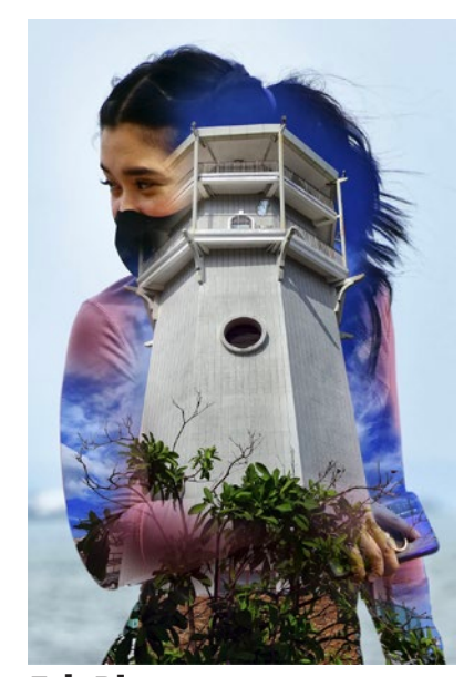
5th Place "Inner Beauty" by Cha Pagdilao Shot with Sony A7III with 18-200 lens