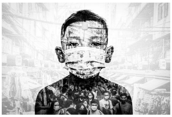
4th Place "A World Full of Facemask" by Mac Omega Nikon D500 with Nikon 16-18 f/2.8-4 lens