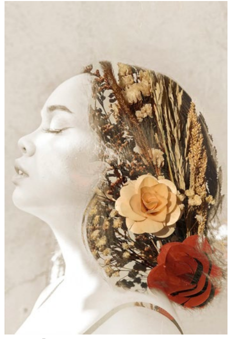
1st Place "Tranquila" by Fria Day Delfin ISO 100; f/5.6; 1/60 sec.