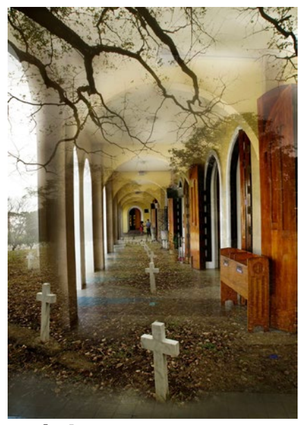
2nd Place "Infinity and Beyond" by Cha Pagdilao Shot with Sony A7III with 11-18 lens