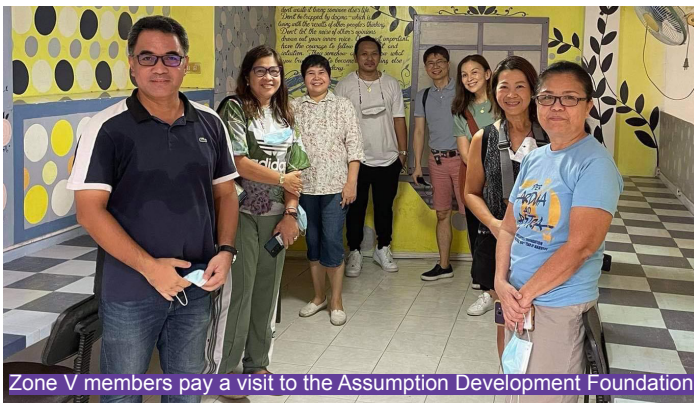
Zone V members pay a visit to the Assumption Development Foundation