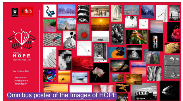
Omnibus poster of the Images of HOPE